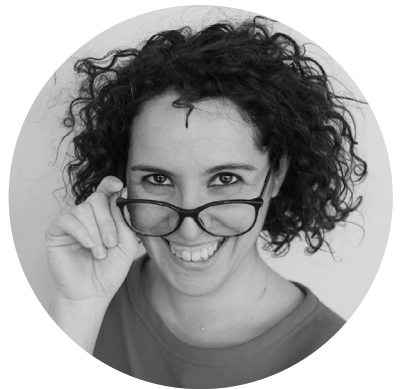
Figure x.8 Homework