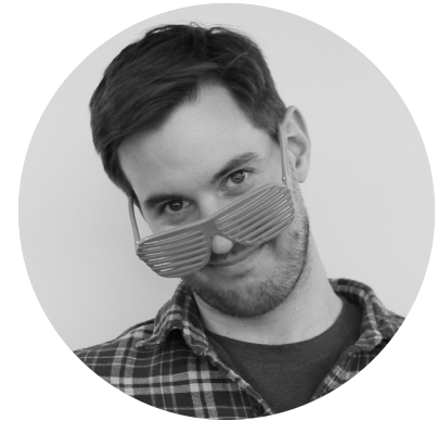
Figure x.7 Accuracy and Rights

Philipp Hoevel acted as our first reader and last editor. The rights were obtained and managed by Brett Common.